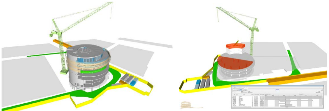
Figure 1 Case Study 1 Pre- Construction Review

KEY BIM DRIVER: An independent architectural consulting firm completed the concept design. The facade subcontractor was the primary catalyst for the use of BIM because of the complexity of the circular design and its façade which included externally fixed timber strips wrapped around the structure. The facade subcontractor manufactured the facade components offsite and transported them to an inner-city site for installation, which was surrounded by public domain. Careful preplanning and logistics were critical to the successful integration. BIM was key to ensure detailed design elements were visualised which included safe transportation, unloading and installation of the façade and other key design elements.